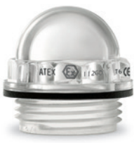
ELESa Original design

Brass nut type GH. (see page ) for fitting to reservoirs with wall thickness smaller than 5 mm.