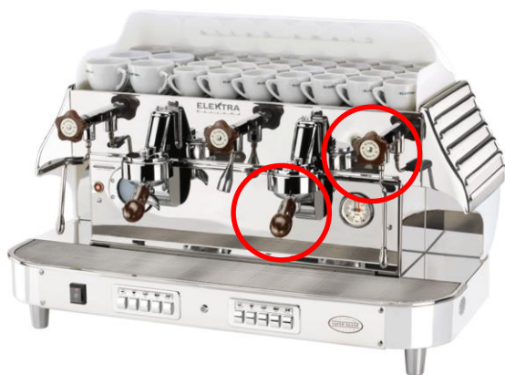
Barlume coffee machine

"We are particularly proud to share the final result of the collaboration with our customer. Our components combined to the steel of these coffee machines, translate into concrete the excellence of these three brands, leader in their own sectors. We are certain that even the smallest aesthetical details of a component contribute to enhance the value and quality of the final product".