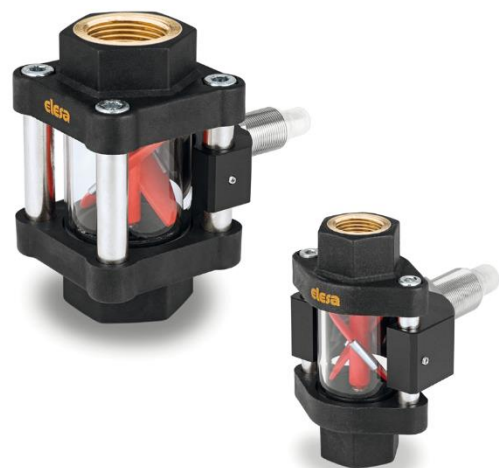
HVF-E visual flow indicators with flow-meter sensors

The brand-new HVF-E visual flow indicators with flow-meter sensor find applications on machines requiring flow measurement, like irrigation systems, heating/cooling systems, machines mixing water and detergents or automatic fluid loading the tanks.