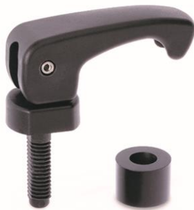
LAC-FL Cam levers