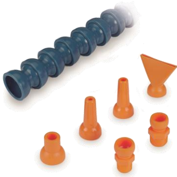
FH. 1/2 kit with tubes with a diameter of 1/2"