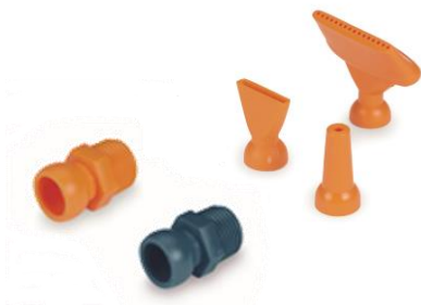
FHJ threaded fittings and FHN nozzles

Elesa+Ganter, always attentive to market needs and to offer a more complete range, has recently introduced a new family in its accessories for hydraulic systems: the modular systems for lubrication . These are a simple answer when lubrication, precise suction of fluids or dust particles are required. In fact, coolant hose solutions are designed to circulate fluids in high capacity industrial and mobile equipment heating and cooling systems, required by operations as turning, drilling, grinding, milling, eroding or drying inks in industrial printers.